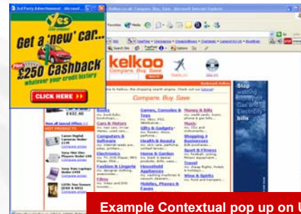
Example Contextual pop up on User Browser

'Targeted Visitor' is a "Full Page" Advertisement of your website delivered to users of eExact Advertising's software applications. Targeted Visitor is priced on a cost-per-view basis which is a cost effective way to drive highly targeted users to websites or specific areas of a particular site. It is a great strategy for businesses that wish to generate lead inquiries and under certain conditions, direct online sales.