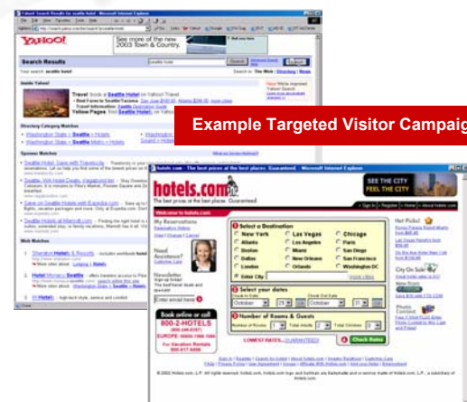
Example Targeted Visitor Campaign

Call adShape for an immediate quote on 020 7428 6680